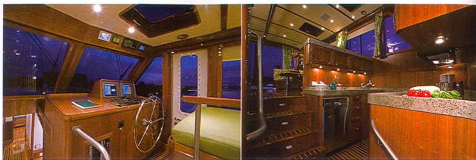
The owner wanted the pilot area within the main saloon so he could be among his family and guests (above left). The galley (above right) is a level below the main saloon, with an open overhead for easy pass-through to the helm.

An expression of the latest in marine technology, the fully-custom Predacious will be the ideal yacht in which to entertain children and adults. Planned cruises include the summer in eastern Long Island with journeys to Newport and Maine. While her molds are available to clients who want to build a semi-custom performance vessel of their own, for these owners, Predacious represents the freedom to explore and subjugate the waters with speed, precision and undoubtedly, predacity. □